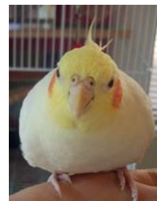
Lutino Cockatiel Listening