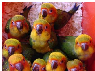
Bucket of Baby Sun Conures