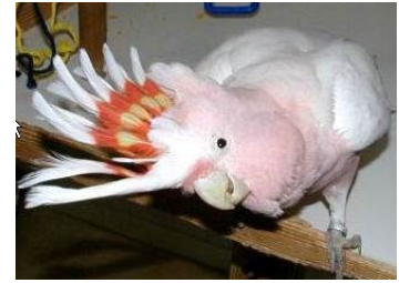
Major Mitchell's Cockatoo

HDBC depends on your support. One of the easiest ways to show your support is to become a member.