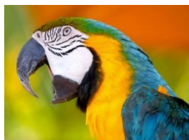
Answer to Avianagram: SQUAWK

For Sale: New and used breeder bird cages. Three flight cages (32"x22"x37") with sturdy rolling stands $50 and up. One stainless steel, dome-top parrot cage (40"x30"x72") $450 obo. All cages are priced below wholesale. Two male Quaker Parrots, one blue and one green, bonded pair $250 obo. Please call Betty Hall at 505-977-2953.