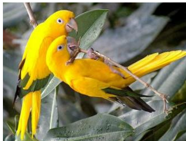
Golden Conures are on the Group IV List

are categorized into Group IV. Importation of any species in Group IV is prohibited for the general public, but may