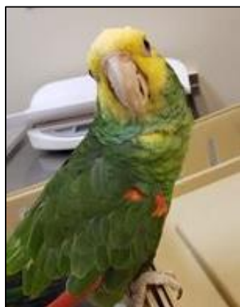
Double Yellow-headed Amazon

Rehoming fees and adoption policy process apply.