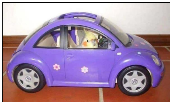
Your Uber Ride is Here