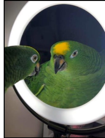
The Covid19 Quarantine 15 (Ya'll know what we mean)