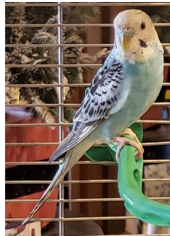
Parakeet - Budgie

Rehoming fees and adoption policy process apply.