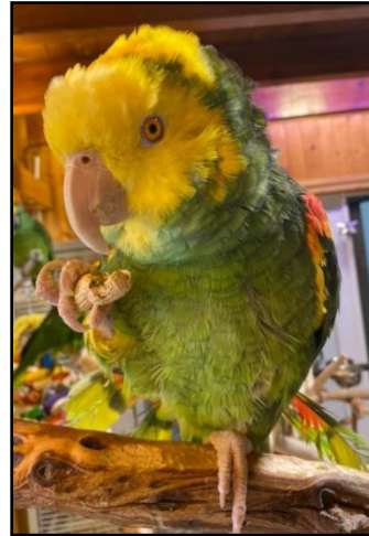
Double Yellow-headed Amazon

Note: Bird adoptions and visitations are on hold until the Covid19 quarantine is lifted.