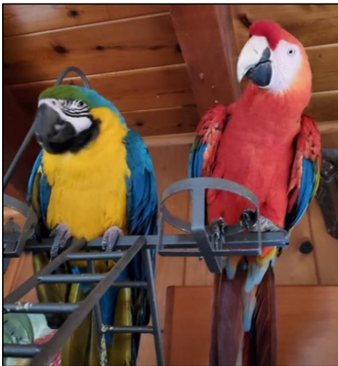
Blue and Gold and Scarlet Macaws

If you're interested in adding a feathered friend to your family, please contact Dorothy Newbill (BFPR) at (505) 980-6166, or you can call our HDBC Pet Bird Rescue Hotline at (505) 554-0804 for assistance.