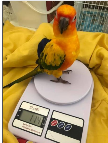
The Look You Give When Someone Says You're Fat