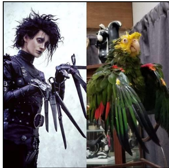
Who Wore It Better?