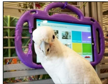
Ellie, a Goffins Cockatoo

https://www.facebook.com/myreadingpets/?ref=page_internal .