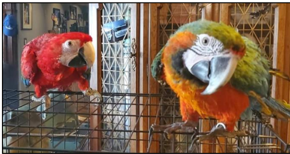
Scarlett and Catalina Macaws