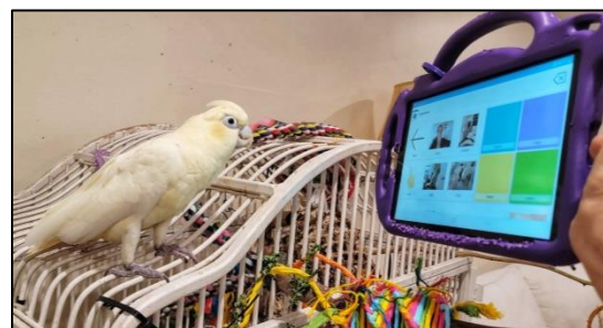
Tillie, a Red-Vented Cockatoo