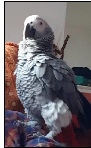
New Fall Fashion - Puffy Pants