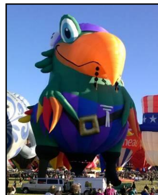
Peg-Legged Pete Parrot Balloon